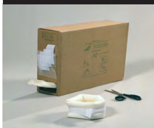
Easy to use dispenser box